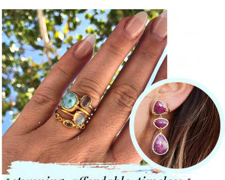
"stunning, affordable, timeless"